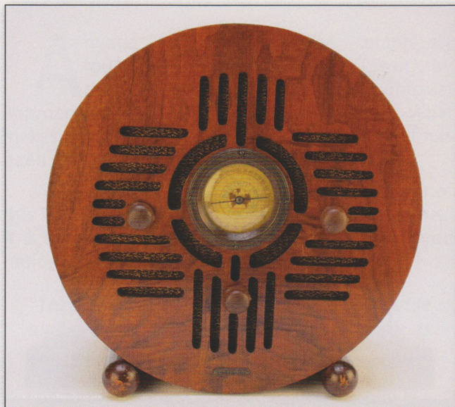
Detrola Model 105 "Wooden Bluebird"

Below is the 1937 Detrola Model 105 "Wooden Bluebird." This set is an obvious attempt to follow in the footsteps of the 1935 Sparton Bluebird in a wooden cabinet. At only 10 inches wide and tall, it is still an eye-catching addition to any collection. One example sold for nearly $4,000 in March of 2012. 5