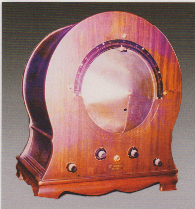
The Thompson "Minuet"

The "G&F Searchlight Radio" can be rotated on both the vertical and horizontal axes. Granger and Feitler marketed this radio in 1937 and may have been influenced by the Sparton as well. There appears to be two versions of this radio since one being sold on Radioattic has an eye tube.