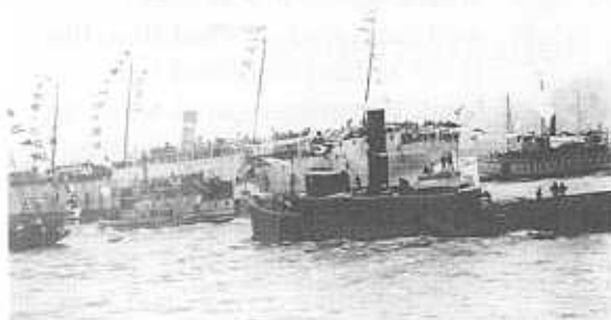
1899 Welcome

At first, tests of the apparatus, initially a Tesla Coil, were made from the Spreckles Building in downtown San Francisco to Telegraph Hill with mixed results due to interference from trolley cars. Later, the receiver was moved to the Cliff House overlooking the Pacific Ocean. This location was away from trolley cars, was closer to the lightship and had a telephone connection. A Ruhmkorff coil spark transmitter was installed on the San Francisco with an aerial, and the wait began.