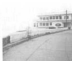
Cliff House—then and now.

At first, tests of the apparatus, initially a Tesla Coil, were made from the Spreckles Building in downtown San Francisco to Telegraph Hill with mixed results due to interference from trolley cars. Later, the receiver was moved to the Cliff House overlooking the Pacific Ocean. This location was away from trolley cars, was closer to the lightship and had a telephone connection. A Ruhmkorff coil spark transmitter was installed on the San Francisco with an aerial, and the wait began.