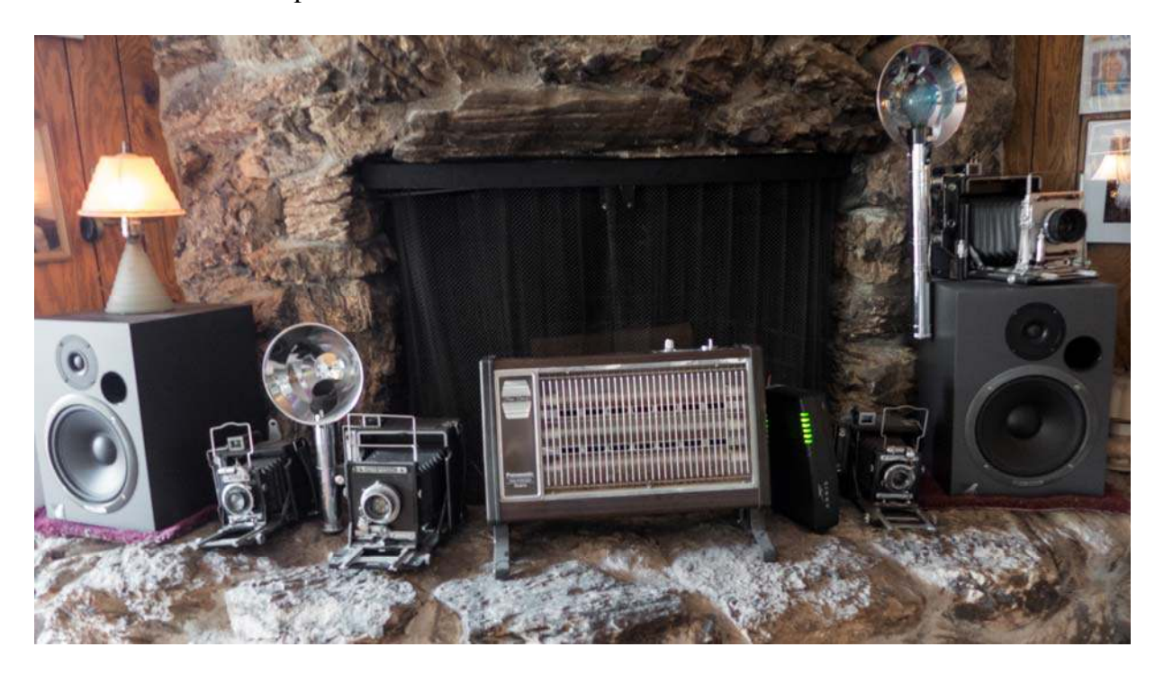
Mike's collection includes Speed Graphic press cameras. The original design of the Star Wars light saber was modeled after the long chrome flash unit next to the speaker.

The side wall that is partly seen in the first image shows a bit of everything. You can see small TVs (he has about 10), cathedrals, a row of TLR cameras, some microphones. Mike has not bought anything new for many years – like many collectors, he is out of room. Adding cameras and the juvenile series he writes about consumes even more space.